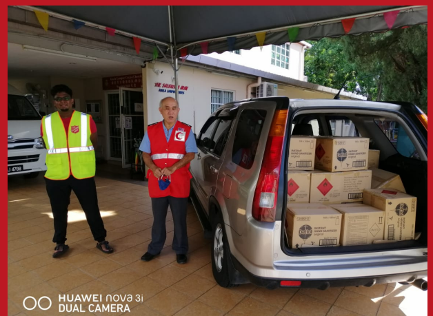
HUAWEI NOV3 3i DUAL CAMERA

We believe by working together to help communities, we can keep everyone safe from the pandemic.