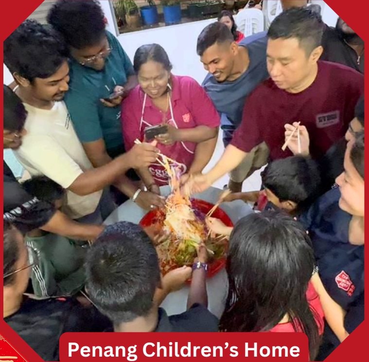
Penang Children's Home