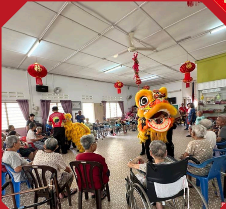
Perak Home for the Aged