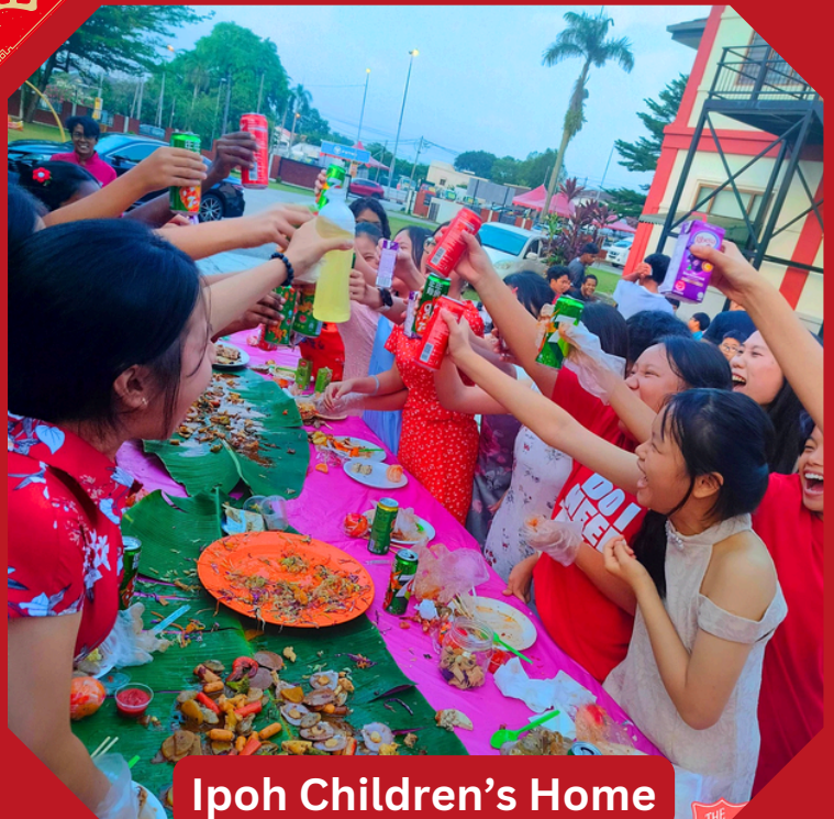
Ipoh Children's Home