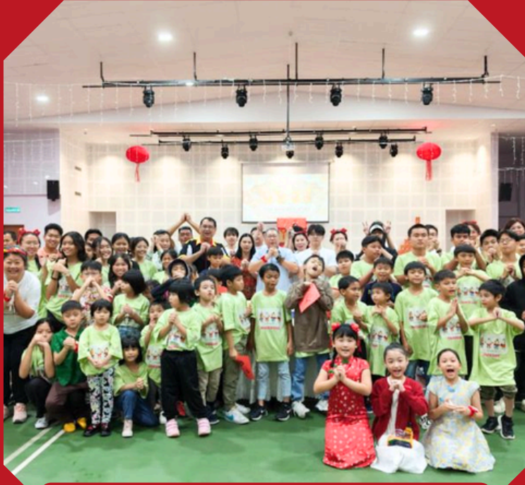
Kuching Children's Care Centre

The children and senior citizens under the care of The Salvation Army had a memorable time celebrating Chinese New Year, thanks to donors and supporters.