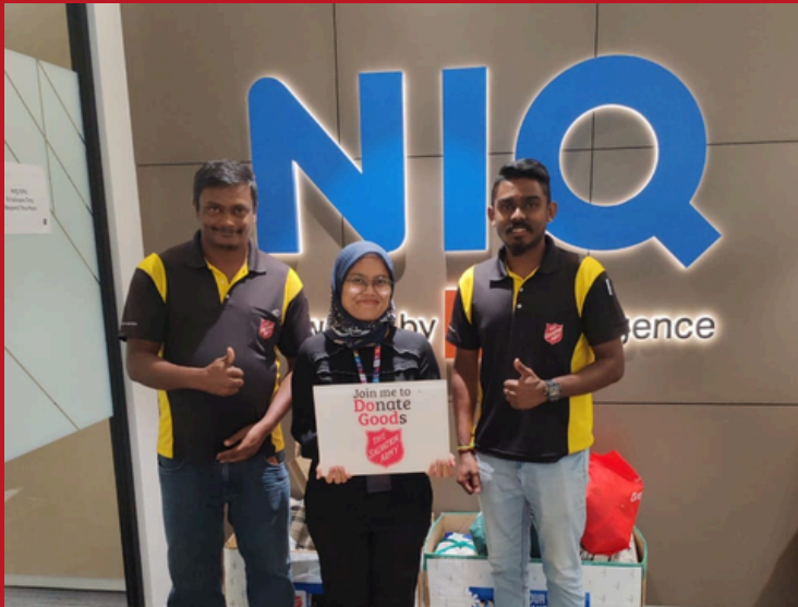
NIQ donated 227 kgs of preloved clothing, books and household items

In the past three months, we have had several corporate companies that partnered with us to help divert unnecessary waste from our landfills.