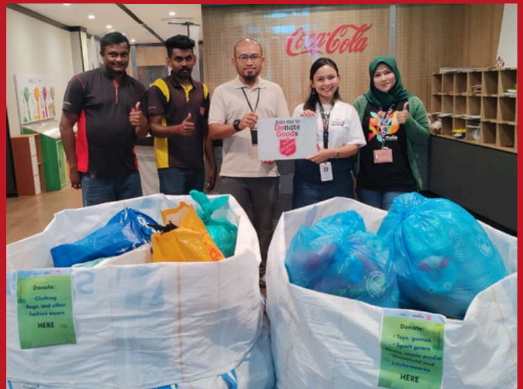
Staff from Coca-Cola Malaysia donated gently-used clothing and household items