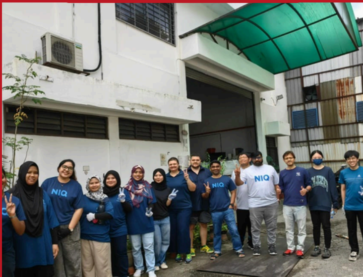
Staff from NIQ volunteered to sort out books and other household items