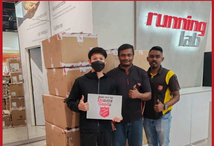
Running Lab ran a campaign to collect 264 cartons of preloved running sneakers from members of the public